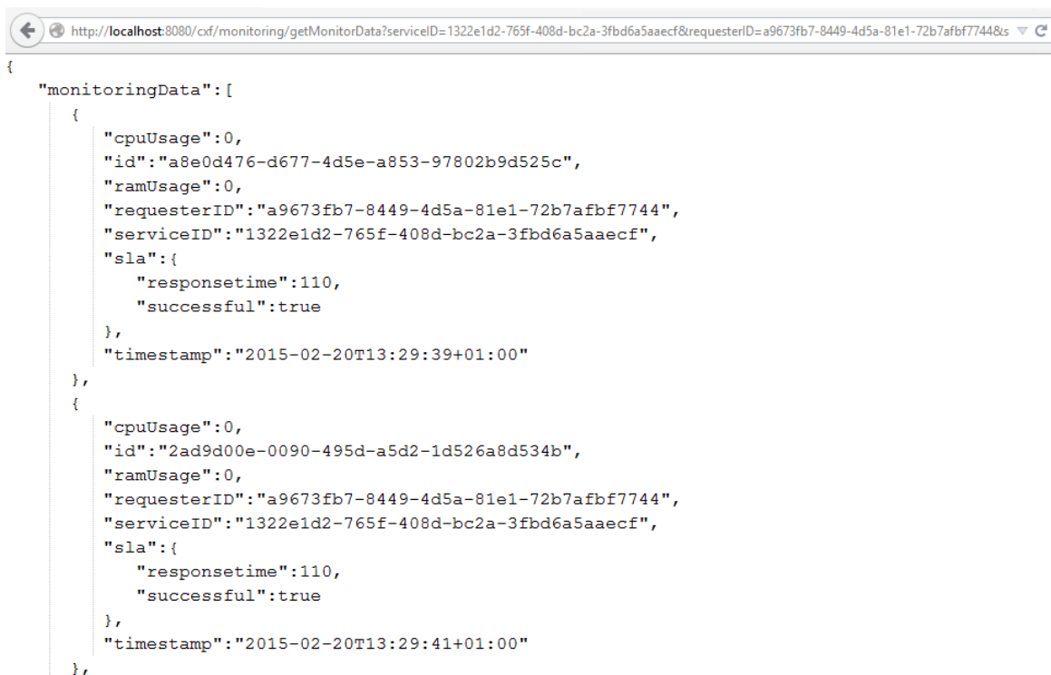
Figure 4: Service Runtime Environment: Result of Get Monitoring Data via Browser