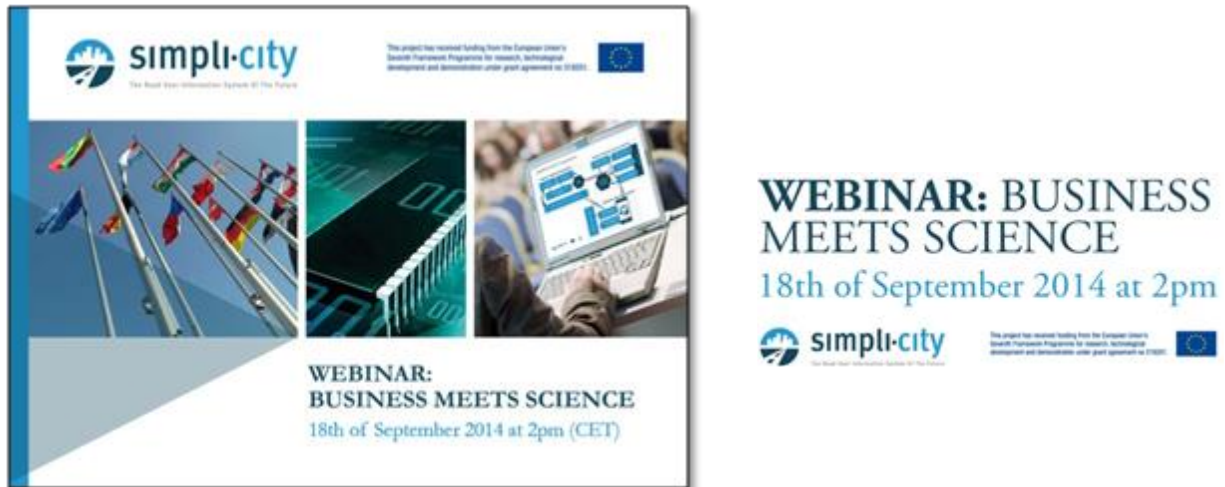
Figure 5: Webinar Invitation and Logo

At the beginning of July 2014, the organisation of the webinar with the same title “Business meets Science” began. The panellists were determined and the agenda was set up. As professional online webinar tool GoToWebinar was selected and a license was bought. The promotion started in July 2014, 2 months before the webinar. The webinar was announced in the third issue of the newsletter and advertised via e-mail and on Facebook. A logo was designed for the advertising materials and for the e-mail promotion as can be seen in Figure 5.