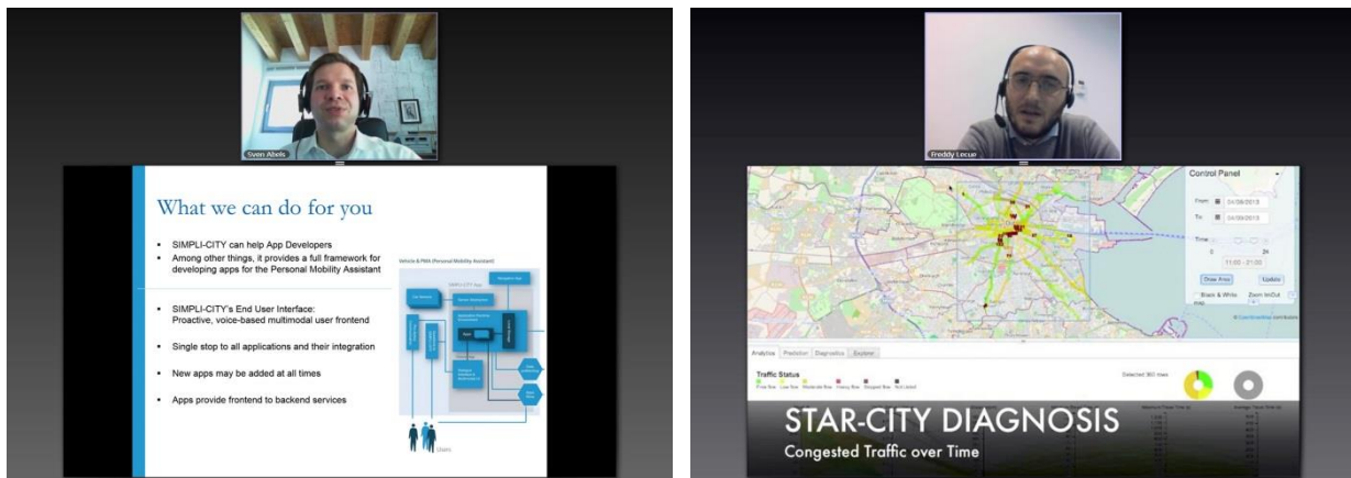
Figure 8: Screenshots of the Webinar

All in all, the webinar was a big success. The feedback of the participants was very good and, compared with the workshop in Helsinki, the dissemination effect was much higher. Even after the webinar, participants sent their feedback and questions per e-mail to FGM.