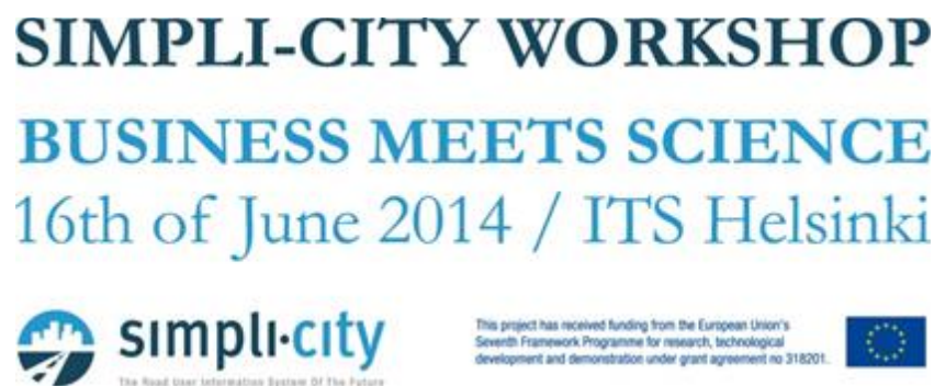
Figure 1: Workshop Logo

As a unique platform dedicated to the trends, achievements and opportunities in European markets, the annually ITS Congress brings together a wealth of decision makers at the highest level, thought leaders, technologists, researchers and a wide range of related experts. It distinguishes itself by the high number of participants, the great diversity of market segments, and the unparalleled quality of its programme. The ITS European Congress in Helsinki was the 10 th edition of this European event, which is well known by the target audience of SIMPLI-CITY. It attracted more than 2,500 participants.